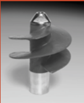
Optional Inducers for lower NPSHR